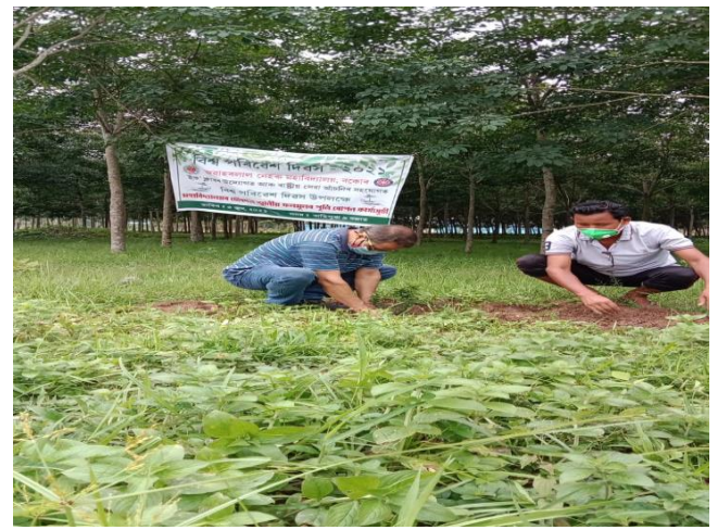
Plantation Programme on World Environment Day