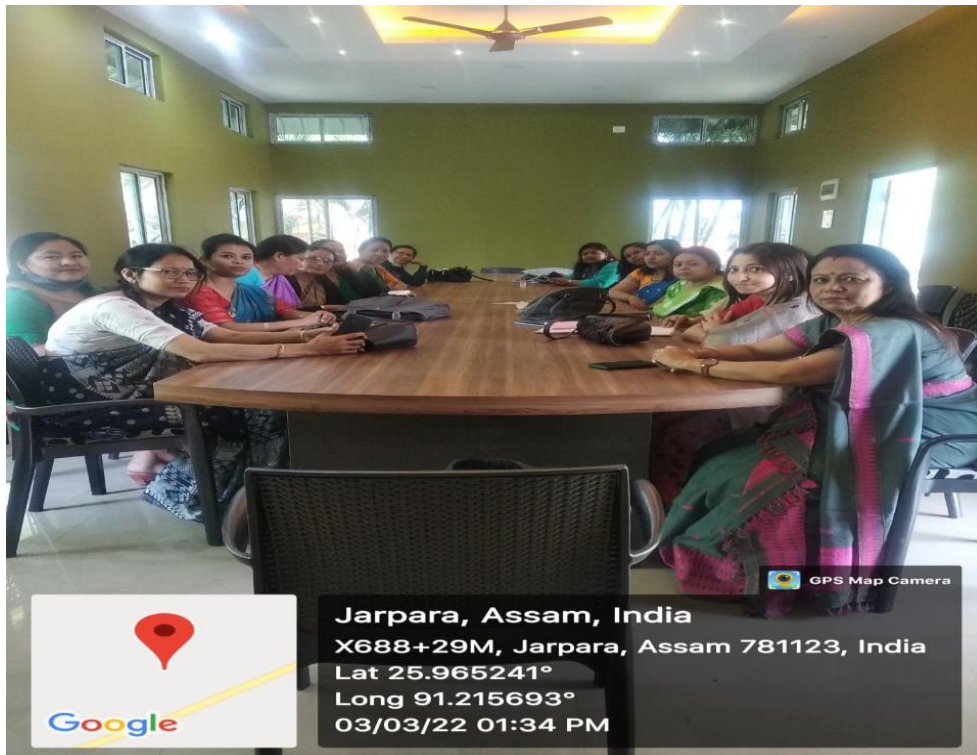
Image 3: Geo-Tagged Photo of the New Committee, Women’s Cell, J N College, Boko