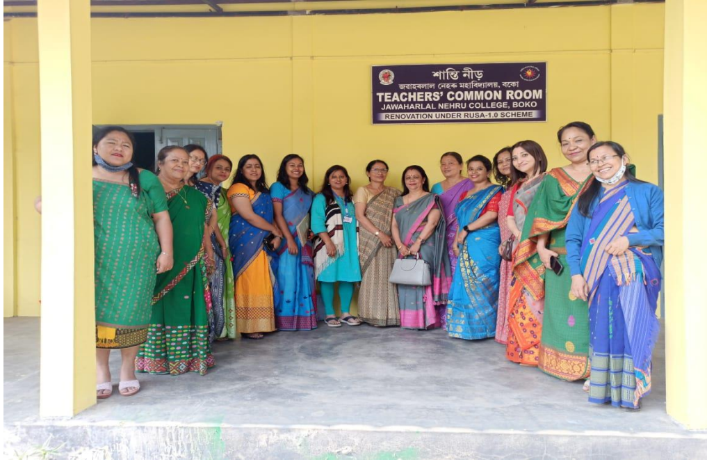
Image 2: Members of the Womens’s Cell and the New Committee, 2022, J N College, Boko