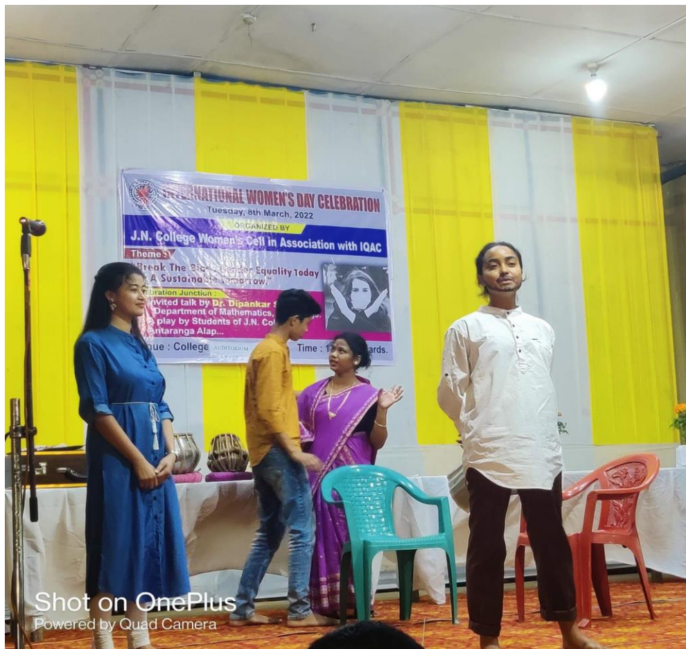
Image V: Moment from the Play during the celebration on 8 th March, 2022