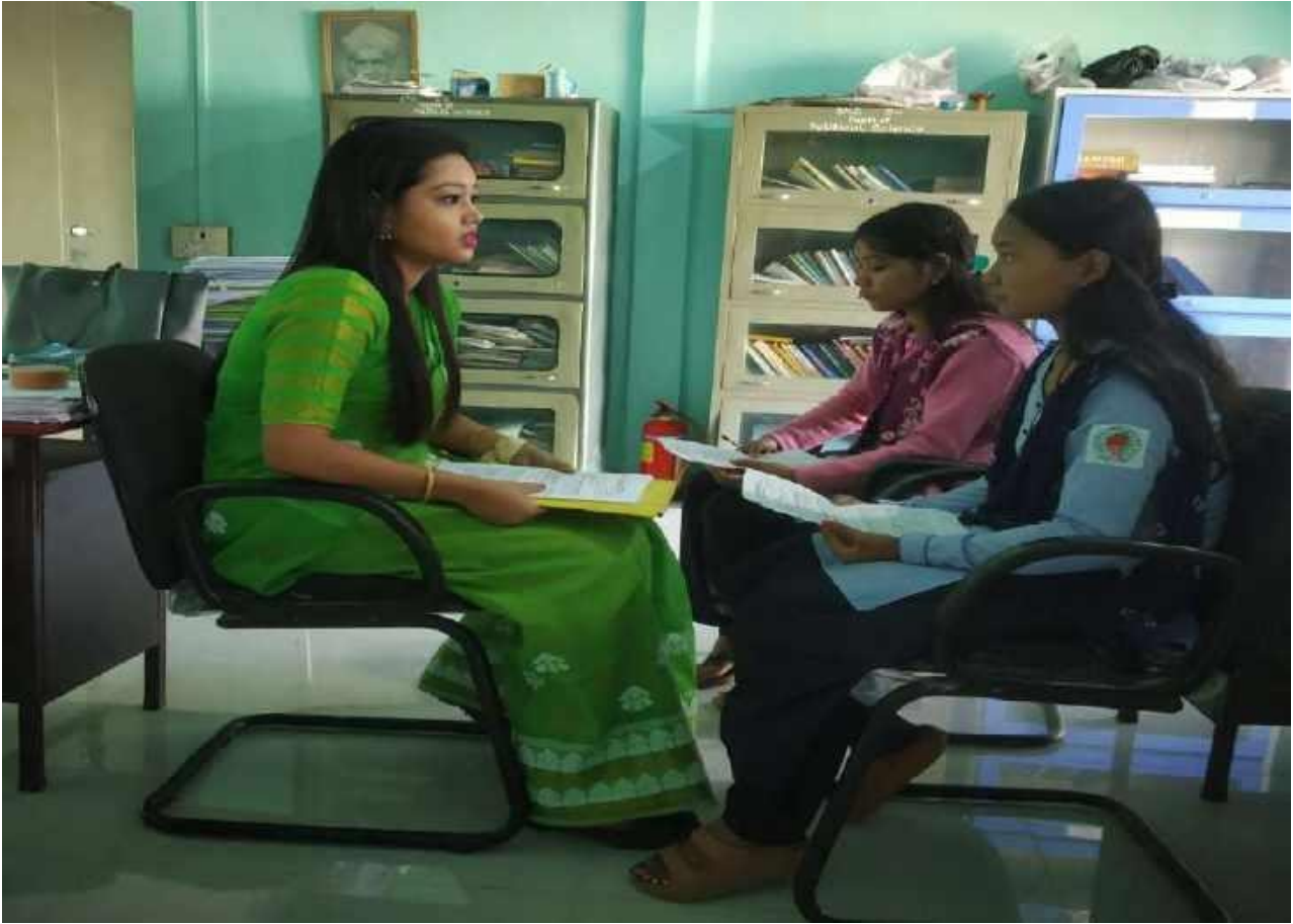
SESSIONAL EXAMINATIONS PHOTOS