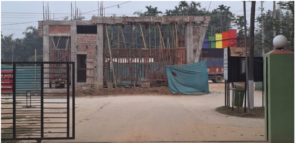
Alumni Contribution of the college main Gate