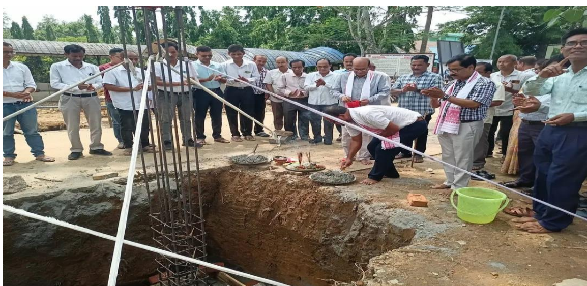
Started construction of College Main Gate on 07-06-2024