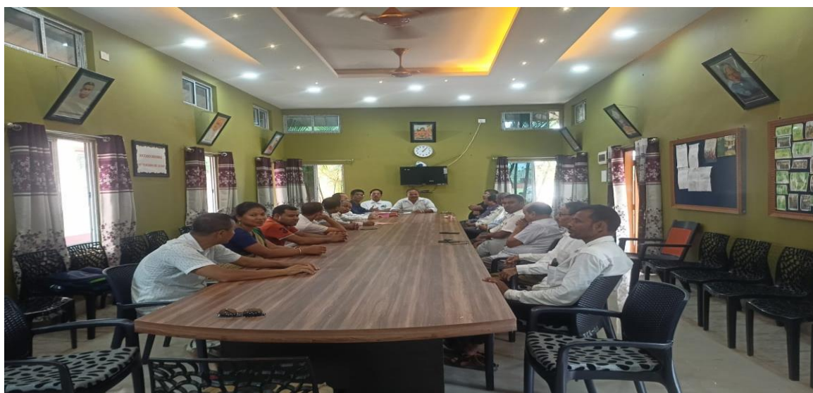
Committee Members General Meeting, 17 th June, 2023